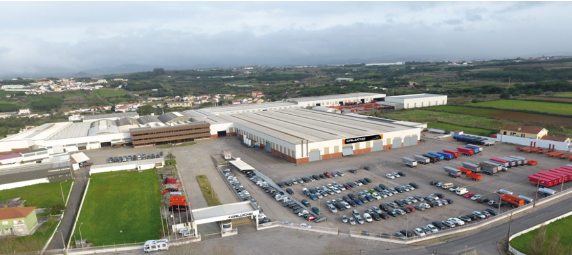
Galucho headquarters São João das Lampas | Sintra | Portugal

With more than 100 years of activity, Galucho is currently specialized in the manufacture of equipment for agriculture and for the industrial transport. Has production centers in Portugal (São João das Lampas and Albergaria) and some strategic partners for the distribution of equipment in international markets, having exported throughout its history to more than 100 countries.