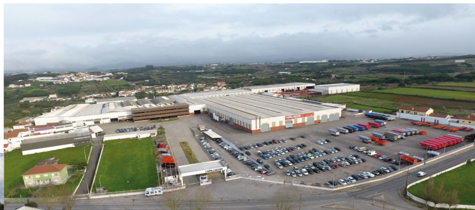
Galucho headquarters São João das Lampas | Sintra | Portugal

Currently Galucho continues to develop its activity on an international scale with production sites in Europe (Portugal) and Africa (Algeria). Our wide range of worldwide strategic partners also helps strengthen Galucho's presence as a global company.