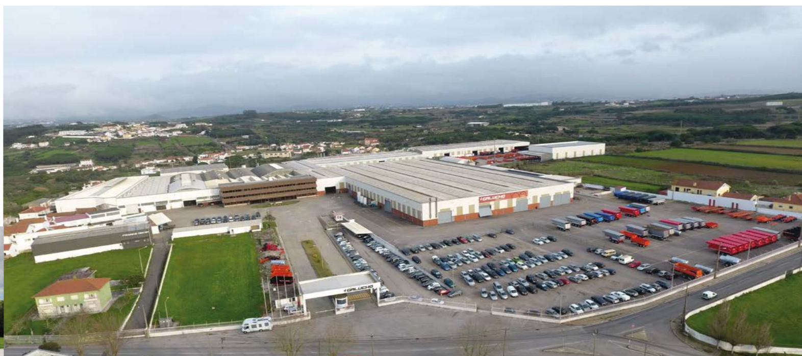
Galucho headquarters São João das Lampas | Sintra | Portugal

Currently Galucho continues to develop its activity on an international scale with production sites in Europe (Portugal) and Africa (Algeria). Our wide range of worldwide strategic partners also helps strengthen Galucho's presence as a global company.