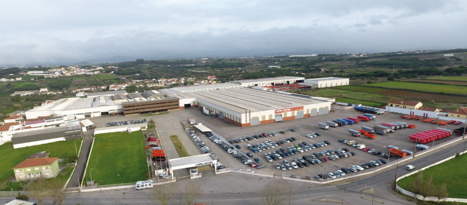
Galucho headquarters São João das Lampas | Sintra | Portugal

Our wide range of worldwide strategic partners also helps strengthen Galucho's presence as a global